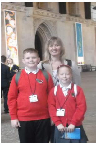
Ambassadors at The Houses of Parliament!

Our reception class teacher visits children in the Icklesham Acorn Nursery and other local playgroups and nurseries, and makes home visits in September. We invite new children to spend time in our reception class before they join us. We have a staggered start for the new pupils in September and parents will be notified of their child's start date. Our admission limit is 15.