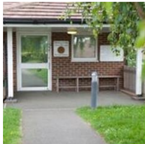
The Acorn Centre - Nursery and Community Room

We use our text messaging service to send any urgent messages and/or reminders to your mobile. Please check your messages on a regular basis.